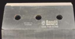
(Model 255XP Knife)