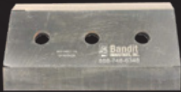
(Model 200XP Knife)