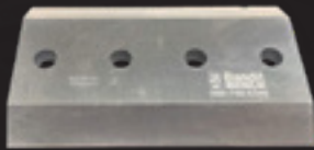
(Model 12X Knife)