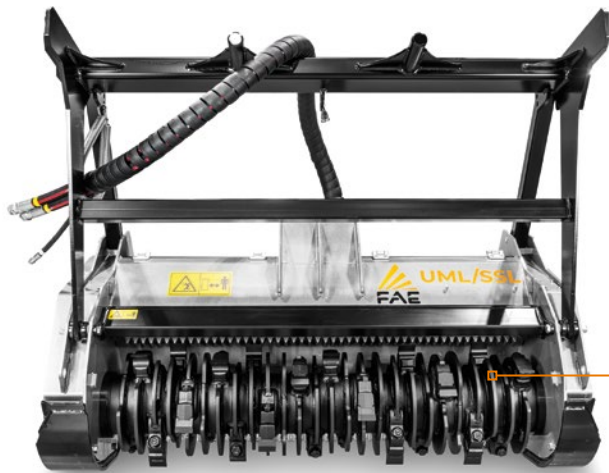
Rotor Bite Limiter