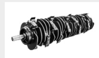
Bite Limiter rotor additional reinforced side plates for extreme conditions