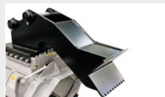
Customized attachment bracket with fixed thumb