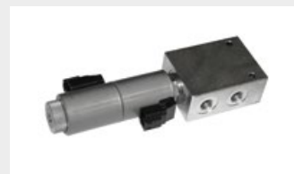
Diverter valve to control the opening and closing of the hydraulic door (UML/EX/VT)