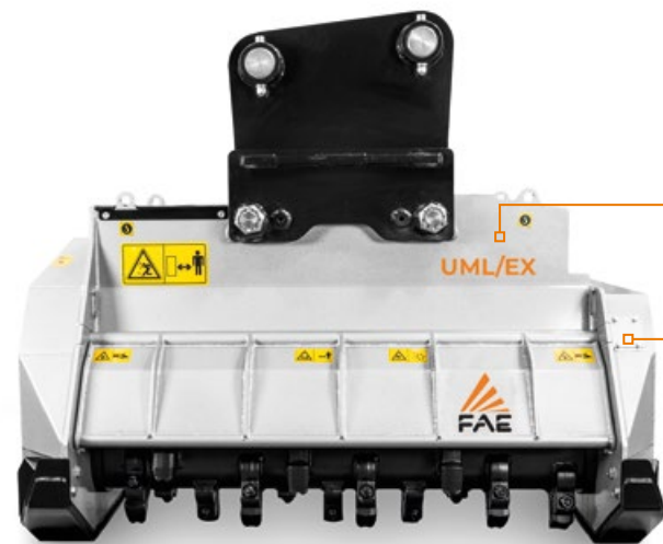
Customized attachment bracket with fixed thumb (optional)