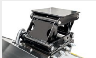
Attachment plate with self levelling device to adapt to all types of terrain