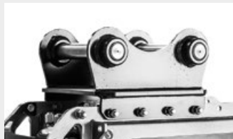
Customized attachment bracket