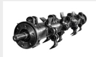
Possibility to have the rotor equipped with PML hammers or Y-flail