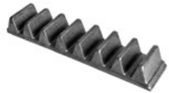
Steel counter-blades helps mulch material into a smaller final size